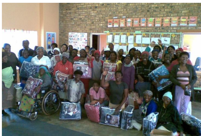
The foster mothers collected the blankets for the orphans