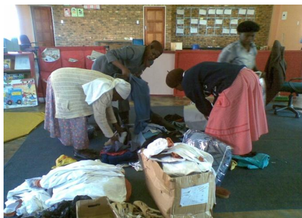
These clothes were meant for the foster mothers and the orphans