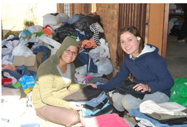
Busy hand of helpers sort out piles of clothes