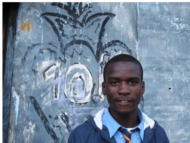
Prince is proud of his home where he even wrote the street number 100 in a very creative way.