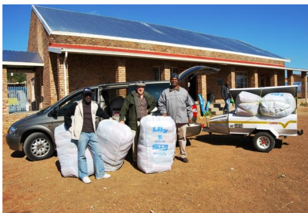
It took a minibus with trailer to transport the blankets

Just in time before the holiday and very welcome during the cold winter season, Acts2Change distributed over 80 blankets for the orphans of the new care centre at Lesedi-Potlana.