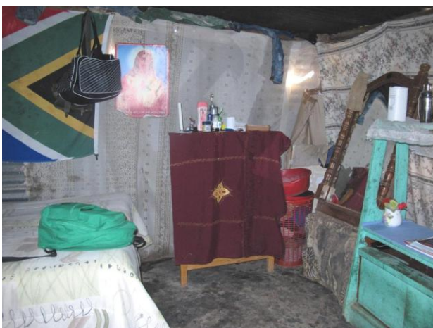
The sleeping corner is cleaned up neatly just as the rest of the shack.