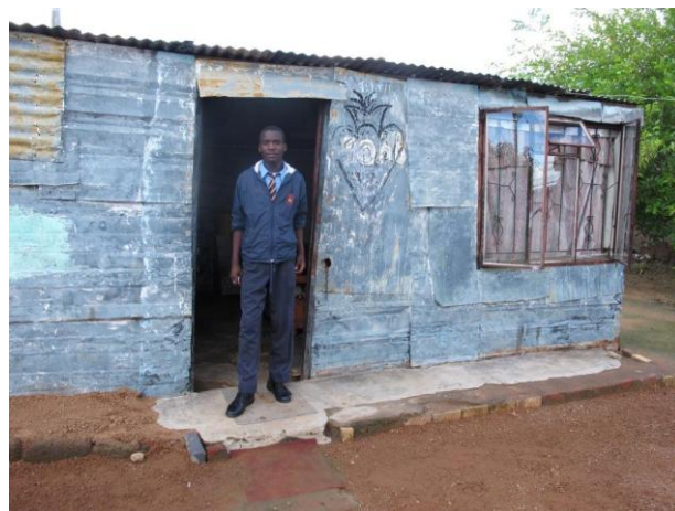
Prince in front of his house. He looks after himself in an exemplary fashion just as he makes sure the area around the house looks spotless.