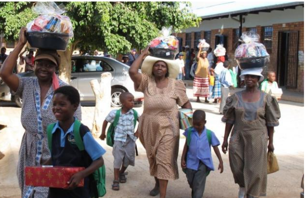
Happy and thankful about the gift giving

Lesedi-Potlana Primary School is the location where we are going to realize our project of a further daycare-center. However, the bureaucracy in the authorities and the mentality and culture very special to us make the process for the new building project highly complicated. Nevertheless, we will be able to officially put in operation the new orphan care center in just a few months time. Fortunately, the feeding scheme is functioning already since last September in an interim solution.